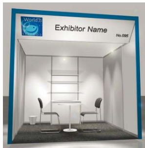
Standard Shell Scheme