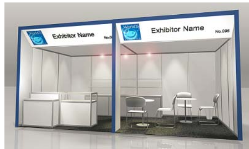
Display Shell Scheme